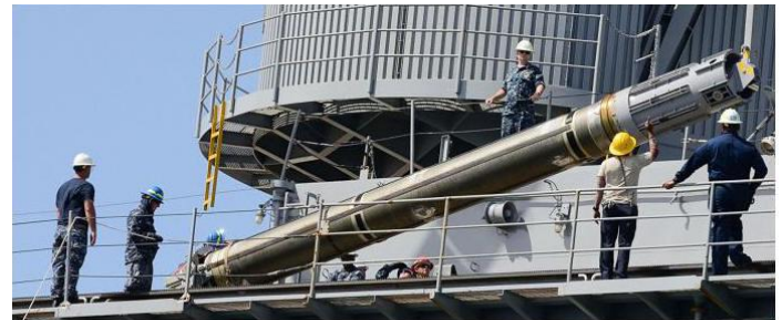
Loading missile aboard ship

crater and a cloud of death. USS Ross and USS Porter were then 1,500 miles away. Westbrook ordered both ships to turn around and go at top speed across the Mediterranean to get in position. Pres. Trump approved the strike at 4:30 pm Thursday, 6 Apr. Ross and Porter were SW of Cyprus and within the 1,000 mile range of their missiles. Washington alerted the Russians that a missile strike was coming, but that it was not intended for them. At 7:36pm, Thurs. the 6 TH the destroyers launched 5 dozen missiles, one falling in the water. The Russians had helicopters and crews at the airbase, but the missiles avoided them.