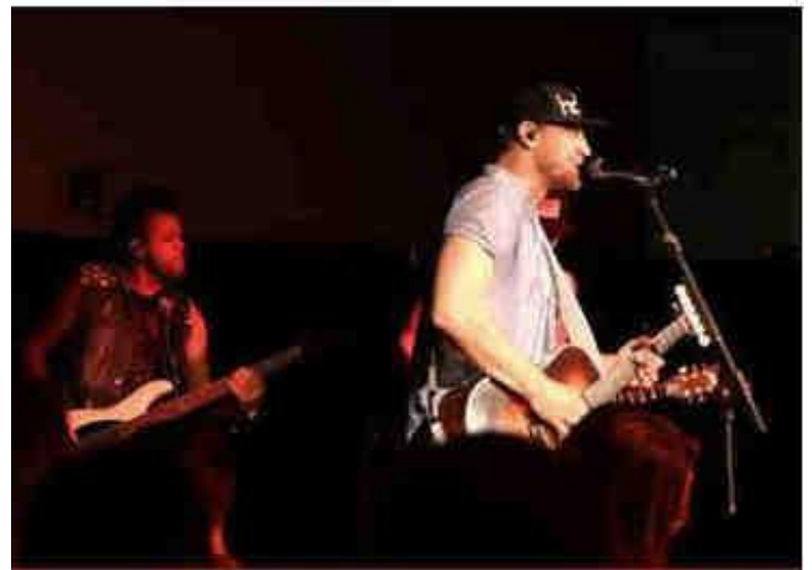
Country singer Chase Rice concert