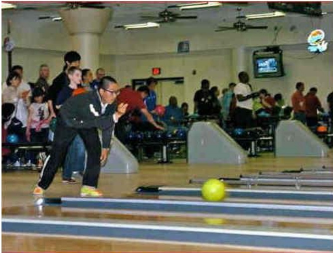
Also there is a bowling alley, movie theater and fitness center.