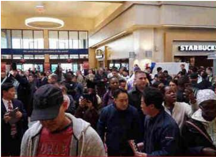
New $64 million shopping mall