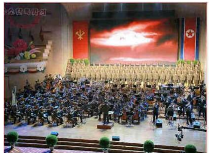
Meanwhile, back in North Korea, a band celebrates an H-bomb test, like Emperor Nero, by fiddling while the world burns.