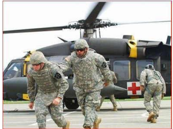
Medical evacuation training