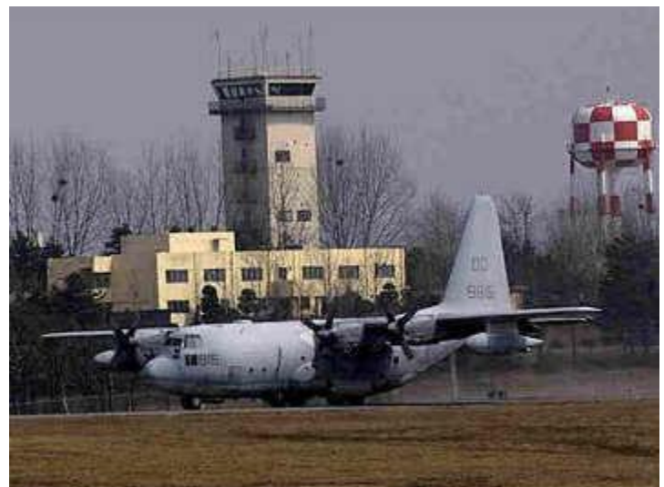
C-130 lands at Camp Humphreys Field