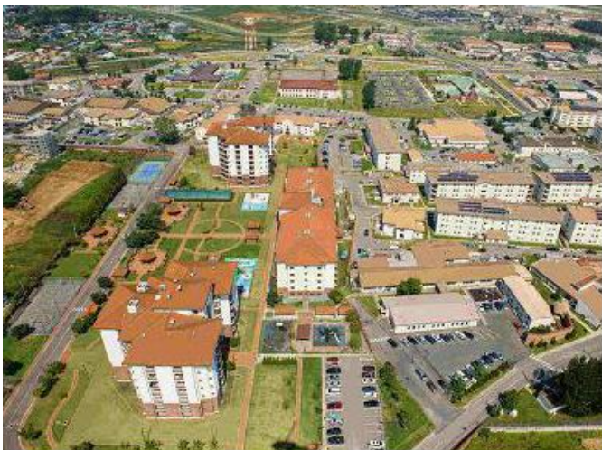
Camp Humphreys is like small-town America.

The Camp was built to resemble a small American city with a shopping mall, churches, a golf course and a high school.