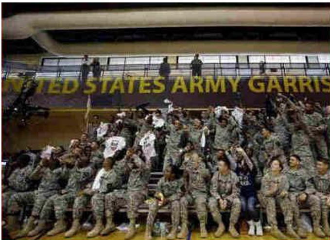
Soldiers cheer at basketball game between 2 visiting college teams.