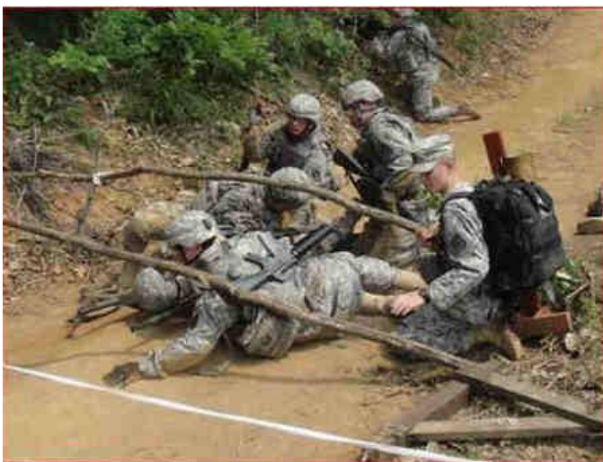
Soldiers at practice