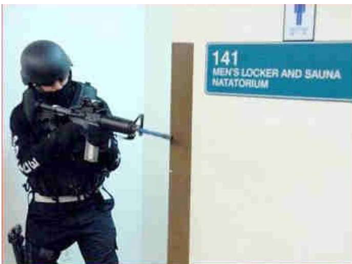
Police practice hostage drill in gym