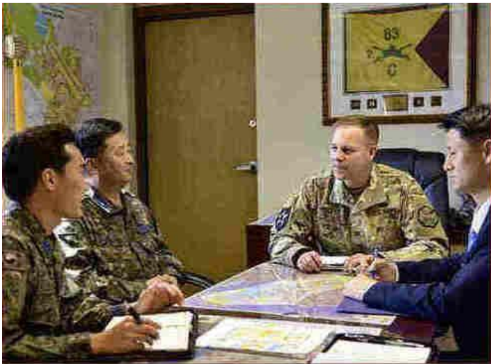
Army meets with representatives of Republic of Korea Air Force