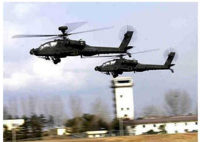
AH-64D Apache Longbow helicopters drill