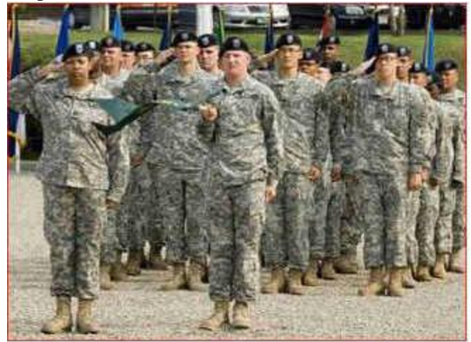
8th Army regiments to be consolidated at Camp Humphreys

When it came time for Camp Humphreys to grow, it expanded into neighboring farms, whose farmers rioted in 2005 in protest. The farmers were paid compensation.