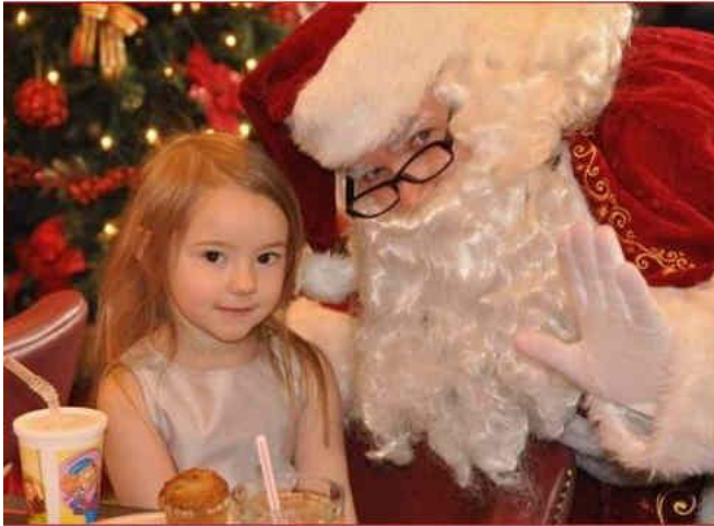
Merry Christmas from Camp Humphreys, South Korea

Camp Humphreys (U.S. Army Garrison Humphreys) in South Korea is the largest overseas U.S. military base in the world. It is next to Desidero Army Airfield, the busiest Army airfield in Asia. In 2004 the U.S. and South Korea agreed to consolidate the 28,500 American troops of the 8 TH Army at Camp Humphreys. This number could be increased to 42,000 American soldiers and civilians by 2020. The $11 billion base is on 1,200 acres which will be expanded to 3,500 acres.