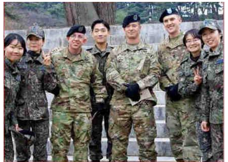
Team building and cultural events