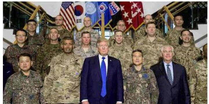
President Trump visited Camp Humphreys on 7 Nov 2017.