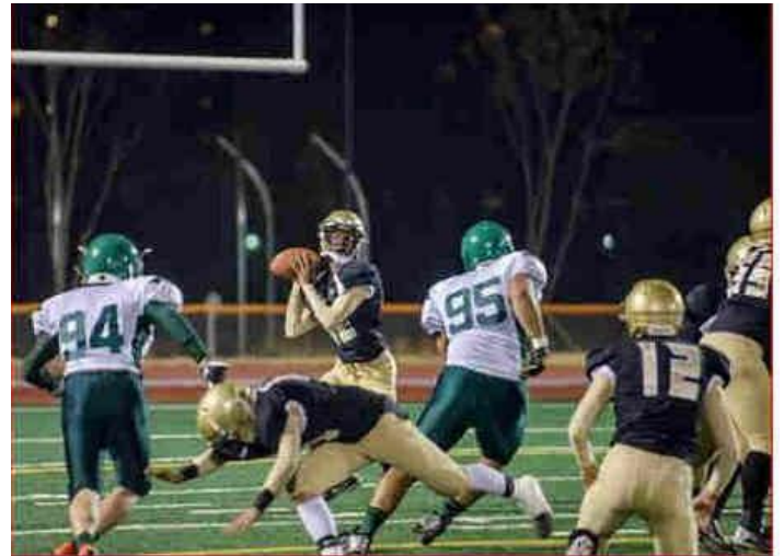
Humphreys High School football team