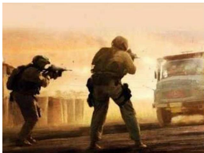
Marines vs. truck bomb